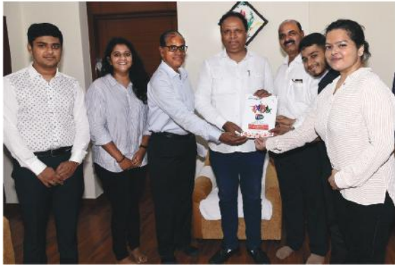
Honorable Shri Ashish Shelar Minister for Sports and Youth Welfare, School Education, Govt. Of Maharashtra