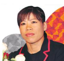
M.C. Mary Kom