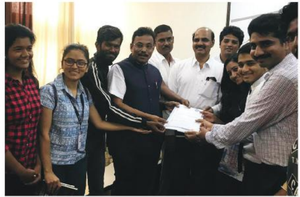
Honorable Shri Vinod Tawde, Ex-Sports and Youth Welfare Minister, Maharashtra and SUMMIT Organizing Team