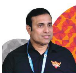
V. V. S. Laxman