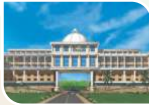
MIT School of Management