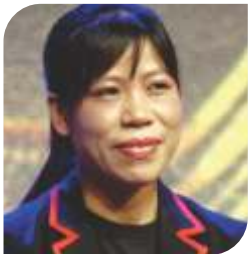
M. C. Mary Kom