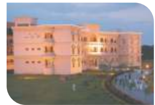
Vishwashanti Gurukul IB World School