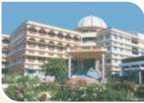
MIT School of Government

32 Years | 65+ Institutions | 65,000 Students