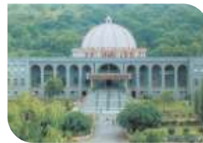
World Peace Centre