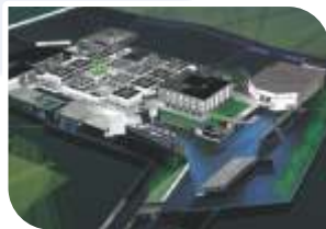
Institute of Design