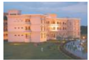
Vishwashanti Gurukul IB World School