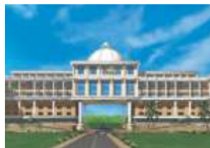
MIT School of Management