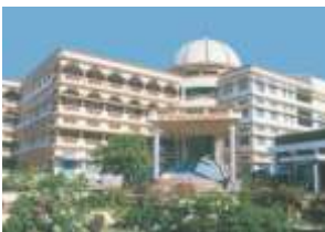
MIT School of Government

30 Years | 65+ Institutions | 65,000 Students