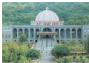
World Peace Centre