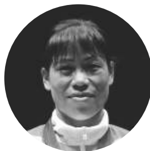
M. C. Mary Kom