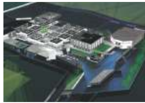
Institute of Design